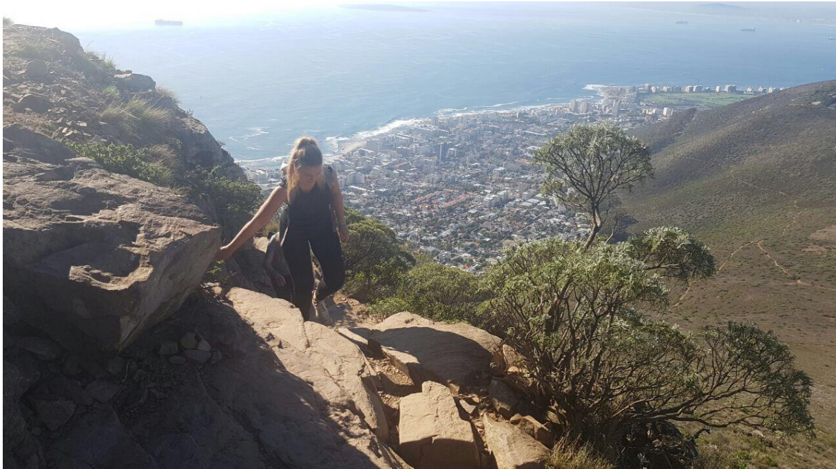
Climbing up Lions Head